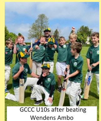
GCCC U10s after beating Wendens Ambo