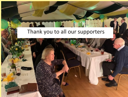
Thank you to all our supporters

The money raised will be used along with money raised in previous years, to improve the net facilities for the fledgling junior section, purchase sight screens so that Angus can see the ball better and score even more runs and also to purchase a bowling machine for use by the juniors and seniors.