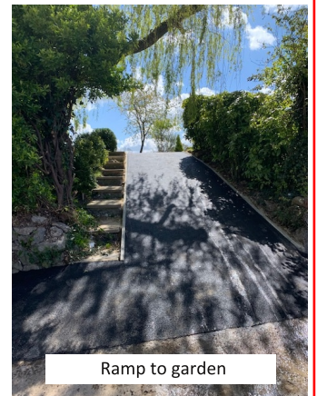
Ramp to garden