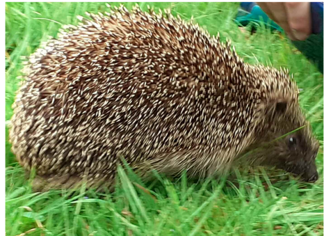
Some new residents in Strethall spotted by Rosie Bates