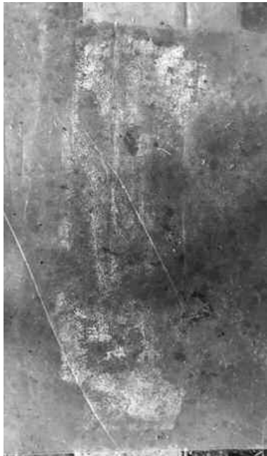
Protective plastic cover on a church floor that has trapped moisture and will lead to mould and decay