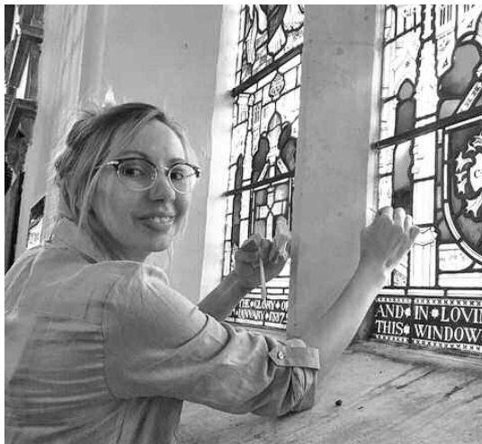
Keeping the church clean

Cleaning a historic church is a large and complex task. There are hard-to-reach places, different materials that need different approaches and historically significant artefacts to be cautious around and at the moment, there is the added pressure to clean and sanitise to make our buildings 'covid-safe'. All of these things coupled with a distinct lack of cleaning volunteers at many churches nationwide, puts our historic church interiors at risk of harm and makes cleaning a burden.